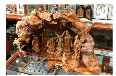
Holy Land Souvenirs

Return to the hotel for dinner and overnight. (First-day the program could be adjusted according to time of arrival)