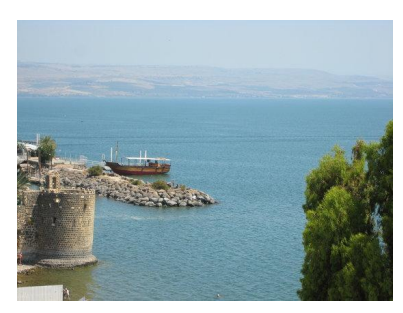
Sea of Galilee (Lake Tiberias)